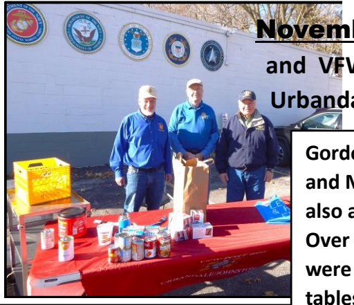
November 18 th Legion and VFW Food Drive for Urbandale Food Pantry.

Patriot Pen and Voice of Democracy winners were judged on November 13. The Post has three Patriot Pen winners and two Voice of Democracy winners and one Teacher of the Year. Presentation of the awards is planned for the December 4 th Post meeting.