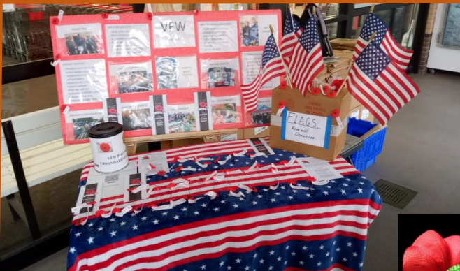
Table display at Johnston Fareway