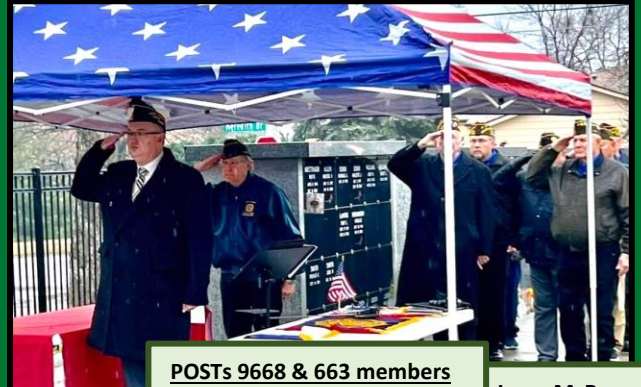
POSTs 9668 & 663 members